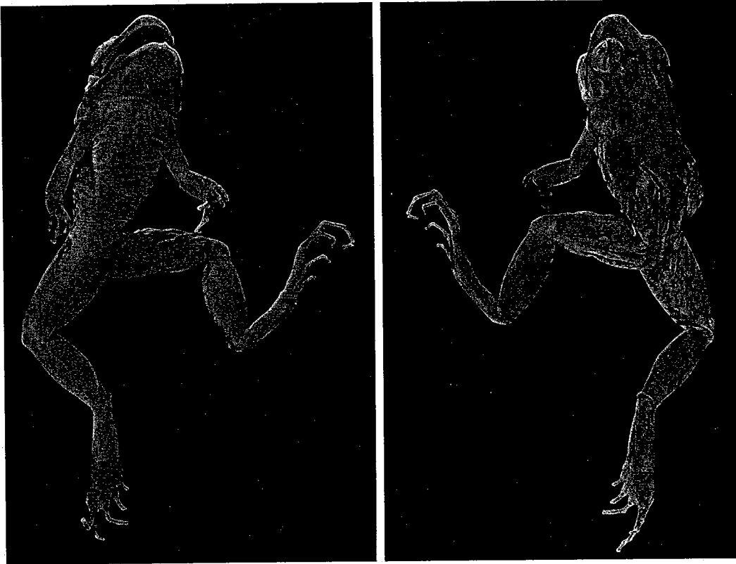
FIG. 1. Dorsal and ventral views of lectotype (ZMUC R 11105) of Cystignathus hylodes Reinhardt and Lütken, 1862.

tiny rounded swellings, lacking grooves. The toes have well-developed lateral fringes joining to form basal webbing between the toes. The subarticular tubercles are moderately developed. The metatarsal fold is distinct. The tarsal fold is also distinct, extending about \frac{1}{2} the length of the tarsus. The dorsal surface of the shank has scattered white-tipped tubercles. The outer face of the tarsus is finely shagreened. The sole of the foot is slightly more shagreened than the tarsus.