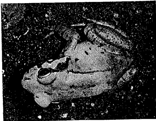
Fig. 1. Leptodactylus stenodema , adult male, Wacará, Vaupés, Colombia.

of the Pentadactylus group are known: L.